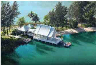
Laguna Phuket's Chapel-on-the-Lagoon

High resolution image available at http://www.lagunaresorts.com/~ftp dm/Pictures/Isabelle&Philippe.JPG