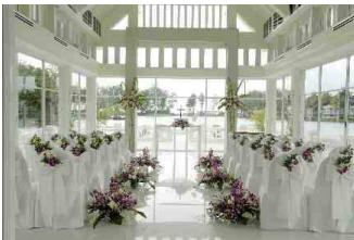
Chapel-on-the-Lagoon interior High resolution image available at http://www.lagunaresorts.com/~ftp dm/Pictures/ChapelInterior1.jpg

High resolution image available at http://www.lagunaresorts.com/~ftp dm/Pictures/chapellagoon.jpg