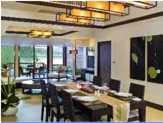
Dusit Laguna Villa living and dining room High resolution image available at http://www.lagunaresorts.com/~ftp/dm/Pictures/DLVLivingRoom1.jpg