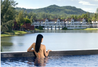
Stunning lagoon view from roof-top pool of Dusit Laguna Villas High resolution image available at http://www.lagunaresorts.com/~ftp/dm/Pictures/DLVView.jpg